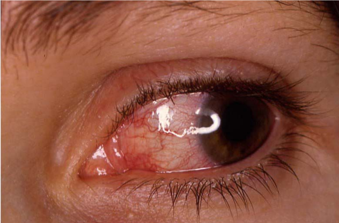
Figure 3. Eye lesions in a patient affected by Behçet's syndrome