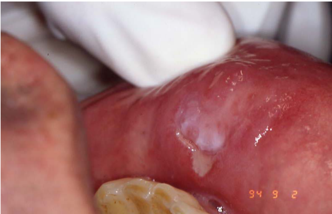
Figure 2. Labial lesion in a patient affected by Behçet's syndrome