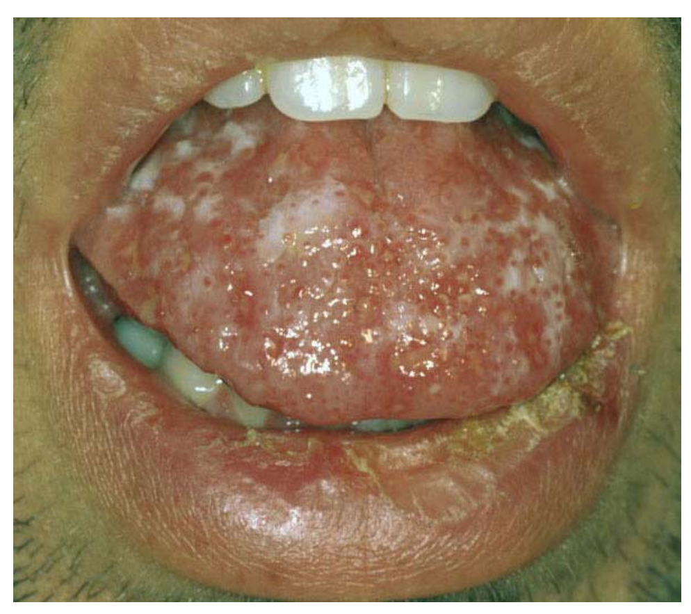
Figure 1. Erythema multiforme: oral and labial lesions