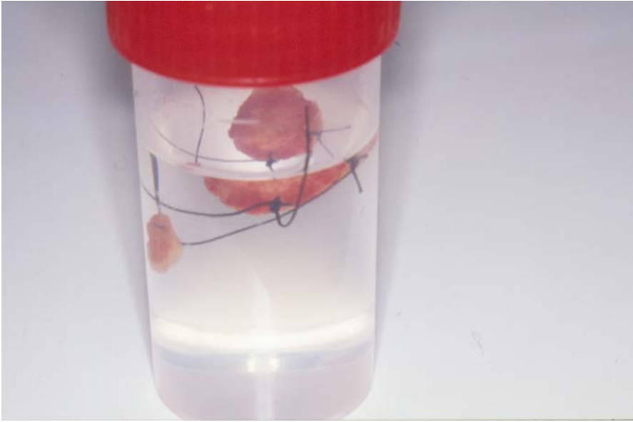
Figure 3. Container with a fixing solution.