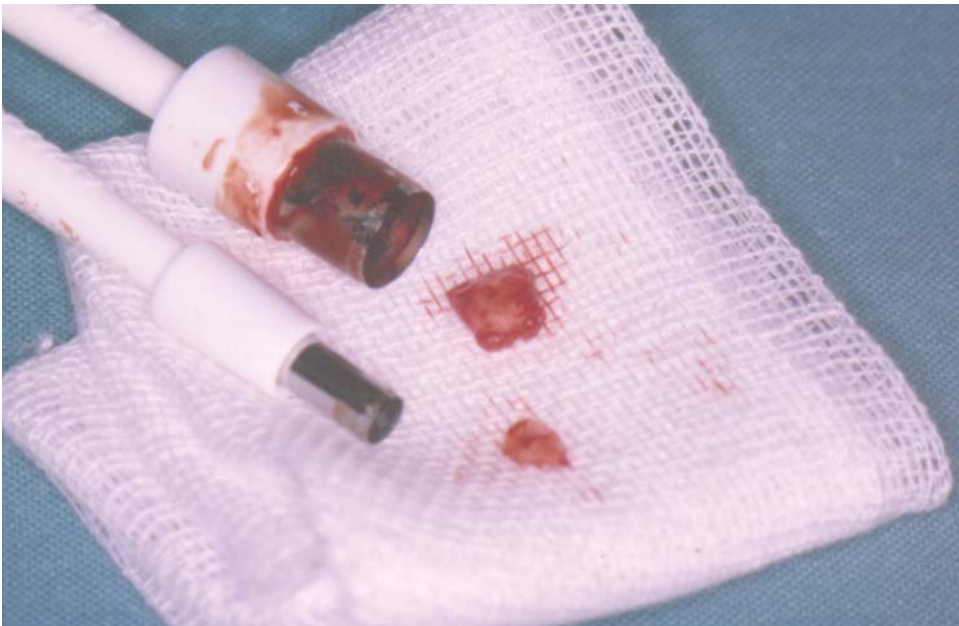
Figure 4. Specimens obtained by punch biopsy.