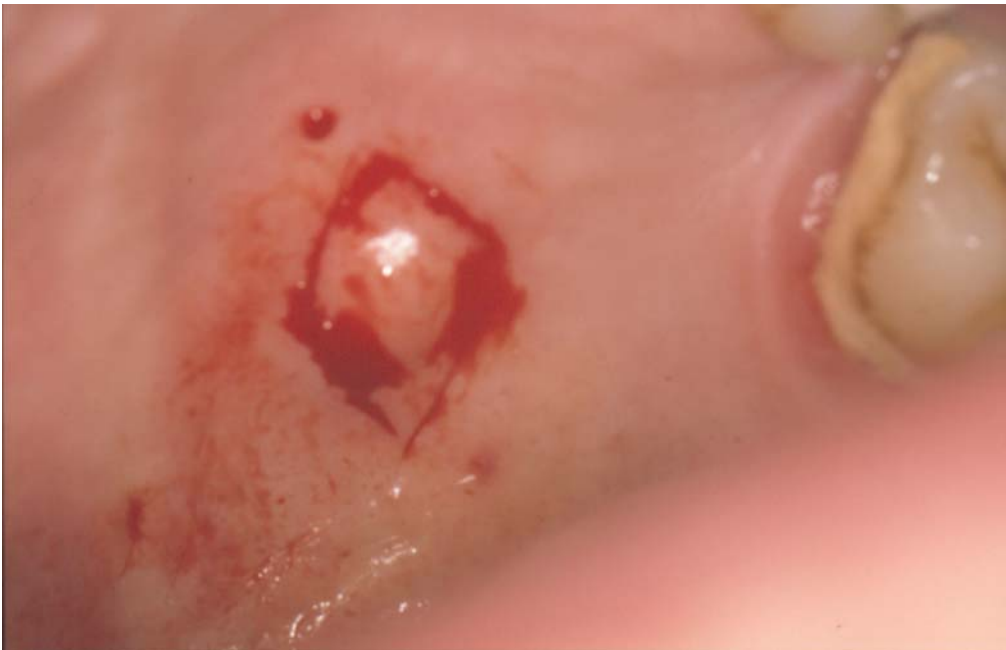
Figure 2. Excisional biopsy of a nodular lesion of the palate.